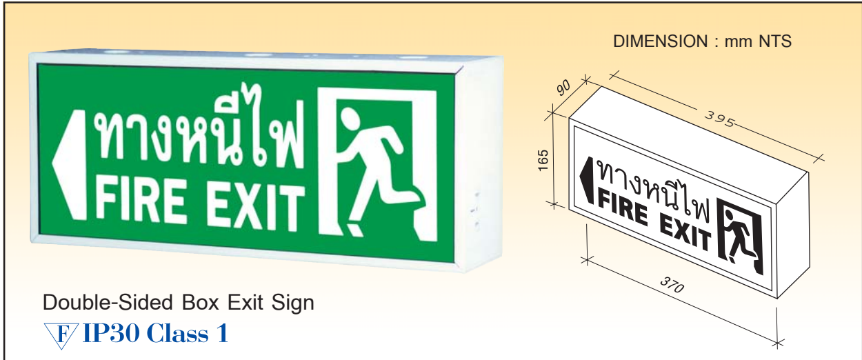
Double-Sided Box Exit Sign IP30 Class 1

This Double-Sided Exit Sign is specially designed with a gear tray which is removable and is independent of the housing to facilitate ease of installation, maintenance and replacement of lamps. It also enhances the Slim Construction of the Box and at the same time provides even and Homogenous Light Distribution.